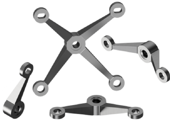
NP-11 SERIES CENTER BOSS SPIDERS