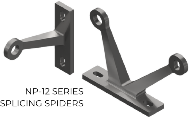
NP-12 SERIES SPLICING SPIDERS